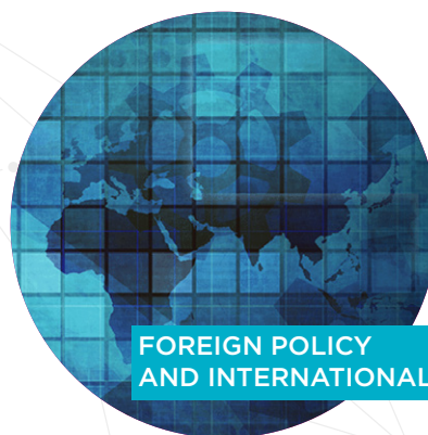
FOREIGN POLICY AND INTERNATIONAL SECURITY

Our program has been designed to address the key challenges the world is facing today. Under the overarching theme “Tackling Challenges Through Dialogue: Towards Cooperation, Development, and Progress” , the forum’s vision is divided into four themes that will be jointly addressed.