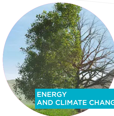
ENERGY AND CLIMATE CHANGE