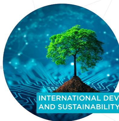
INTERNATIONAL DEVELOPMENT AND SUSTAINABILITY