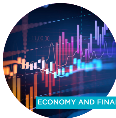
ECONOMY AND FINANCE